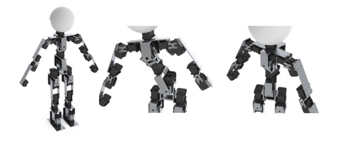
Fig. 1. Acroban Global Structure

2-revolute joints link. We essentially focused on designing a mechanically rich and open structure in the area of the vertebral column and the pelvis, providing it with 11 degrees of freedom.