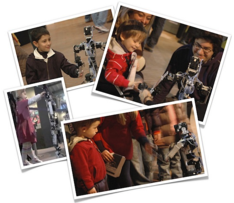
Fig. 1. Robust and playful physical child-robot interaction with Acroban. Around 150 children personally and continuously interacted with Acroban during a whole week-end in a public space in Citta della Scienza, Napoli, Italy.

http://www.youtube.com/watch?v=gKEjkckxzBU